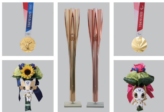
Medal, Victory Bouquet, Relay Torch

Dates (2nd period) From Friday, December 15 to Sunday, March 10, 2024 Venue 1F, SusHi Tech Square (opposite the Tokyo Kotsu Kaikan) 3-8-3 Marunouchi, Chiyoda-ku, Tokyo 100-0005